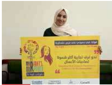
Women empowerment through the Generating Revenue Opportunities for Women and Youth (GROW) project.